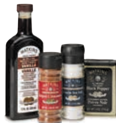
Natural Gourmet pages 3-9

All of the above Points of Superiority make up THE WATKINS WAY, and you will agree that it is a good way.