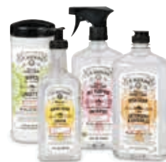
Natural Plant-Based Home Care pages 17-20