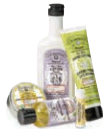
Natural Body Care pages 10-16