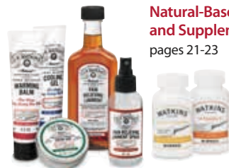
Natural-Based Remedies and Supplements pages 21-23